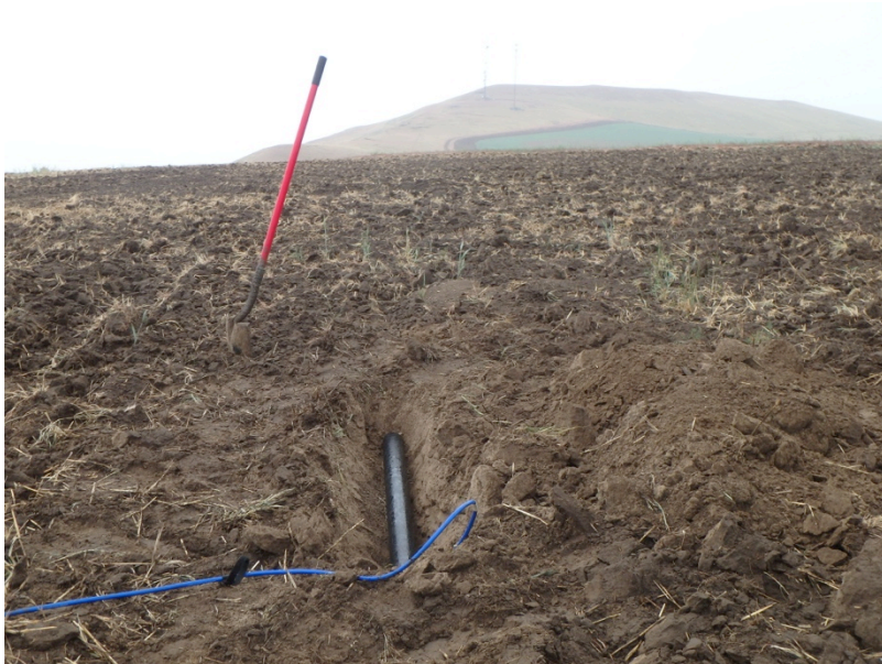
Rattlesnake Mountain. East-west trench with LEMI-120 before burial.