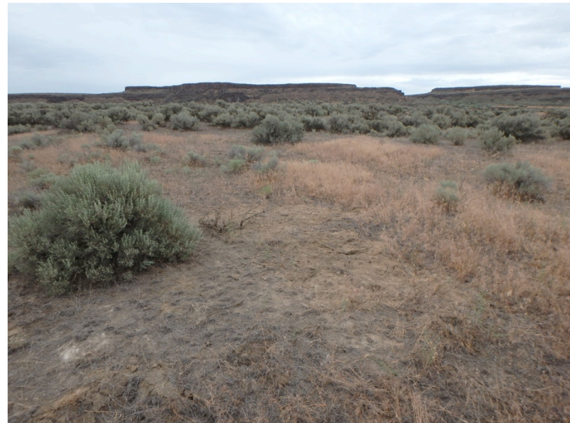
Drumheller Channels. After: trenches filled in and impact minimized, good practice for field measurements.