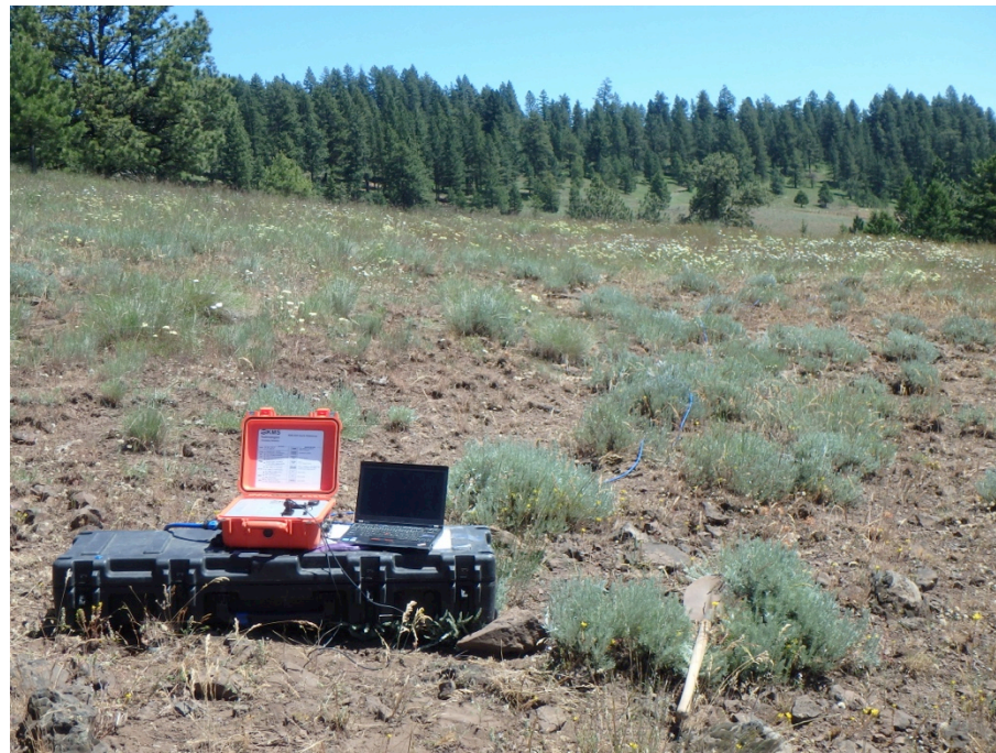
Table Mountain. View East toward the DAQ system and magnetometer (not visible).