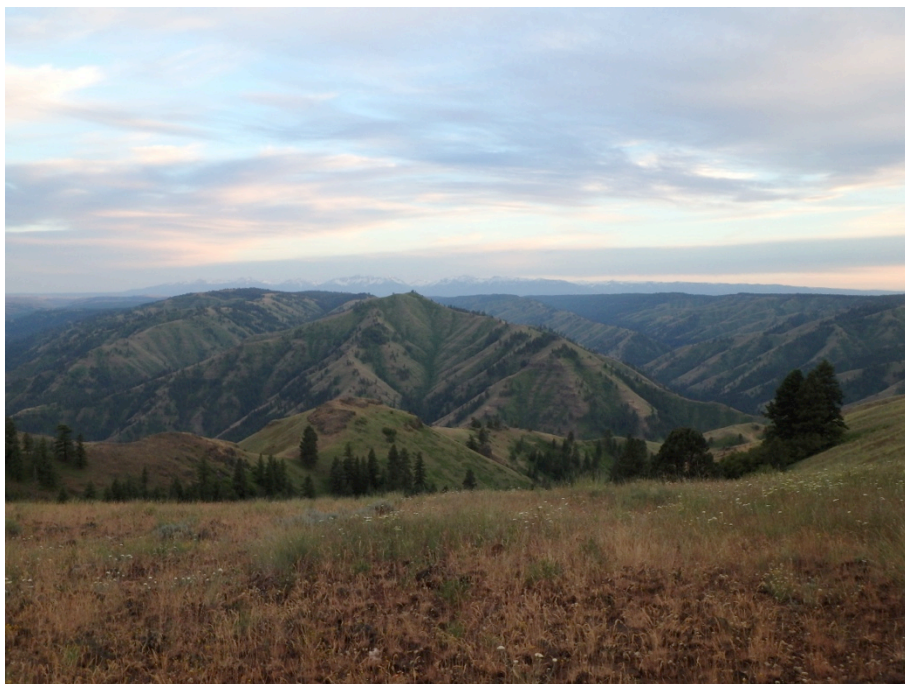
Table Mountain. View South towards the Wallawas