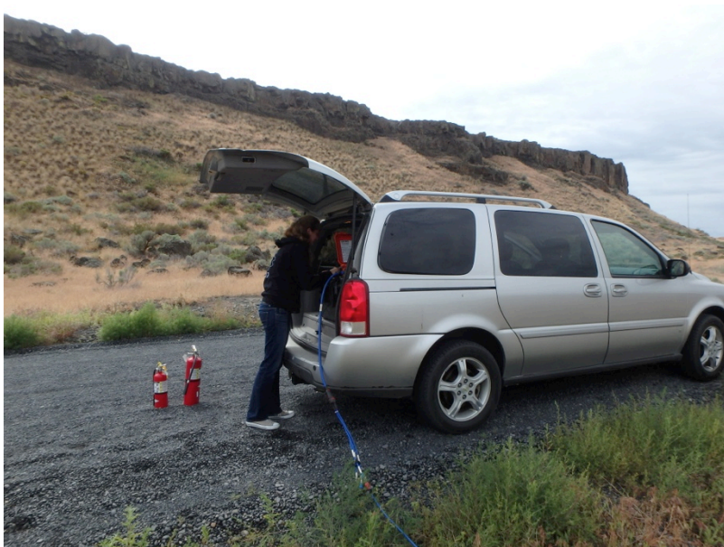
Drumheller Channels: Christina setting up the acquisition system.