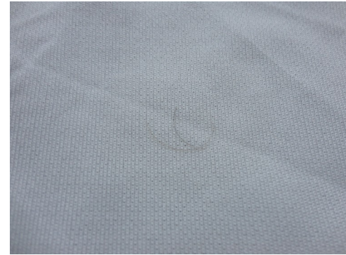
Above: Items removed from north beamtube bellows