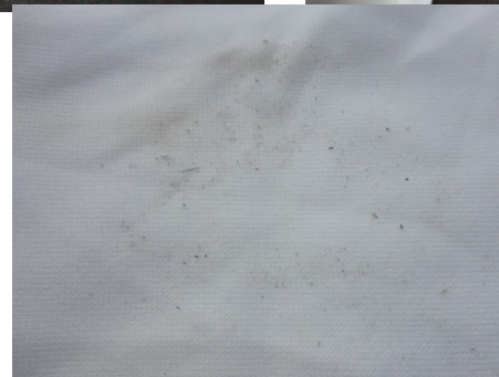
Above: Items removed or wiped from east beamtube bellows, manifold “drop off” and manifold proper