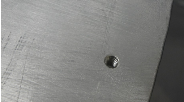
Two "new" small drilled and tapped holes