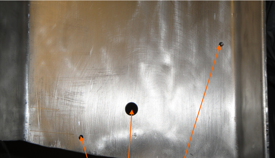
Regular hole for flooring J-bolt (Large, smooth bore) New holes (Small, tapped)