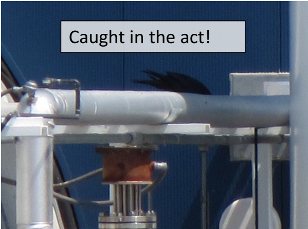
Caught in the act!