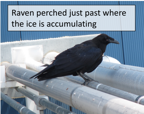
Raven perched just past where the ice is accumulating