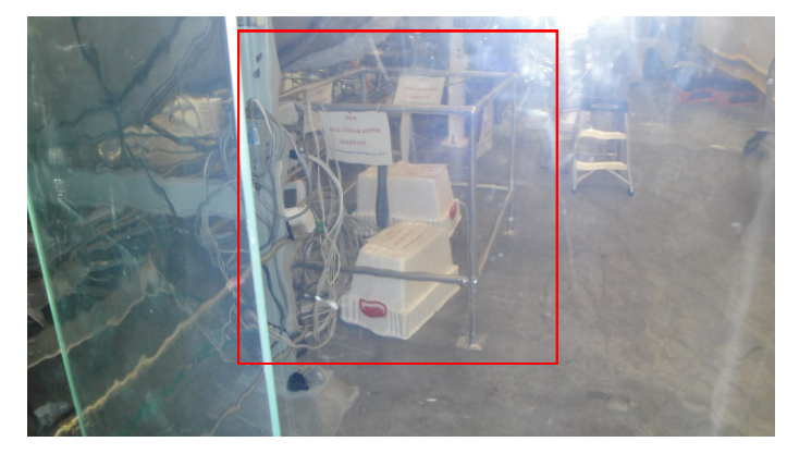
PEM station will be removed for assembly and install work