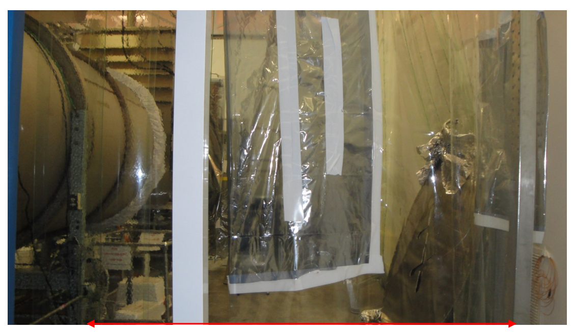
Width available for work = ^84 " or 7 ft (Distance from spool leg to cleanroom leg) Length available for work = ^192 " or 16 ft (Distance from cleanroom leg to cleanroom leg) We could get a little more space if needed.