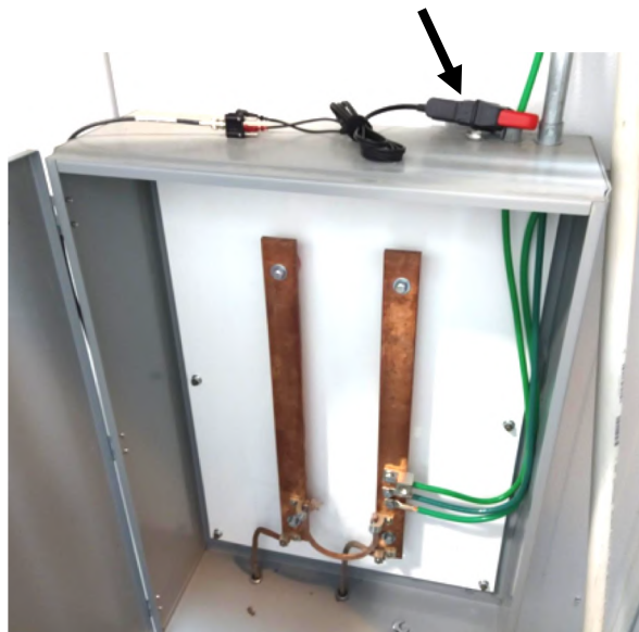
Ground cable connected to racks, and chassis (including ESD) cable tray, beam tube

Current clamp on ground cable shown to left.