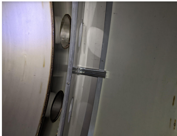
New hardware in place